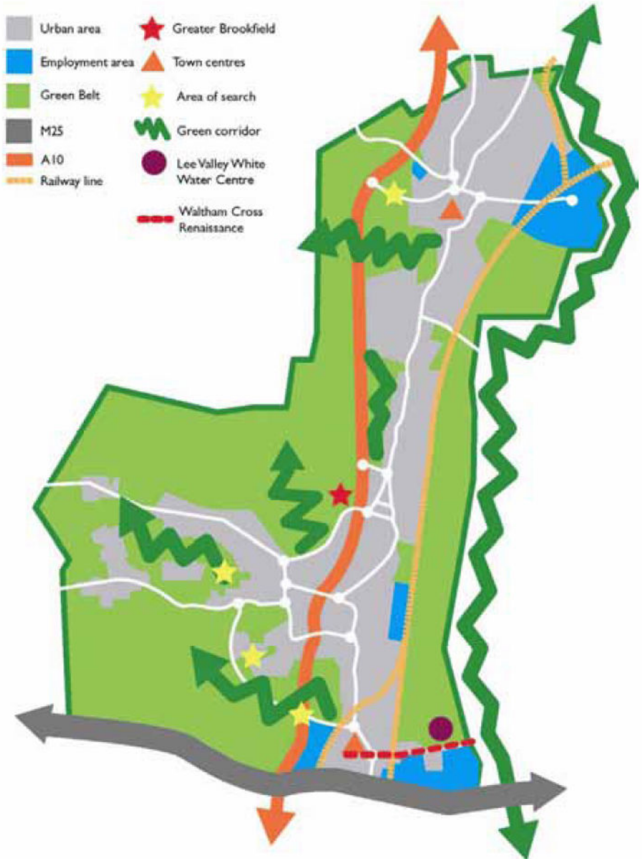
Map 3: Key Diagram